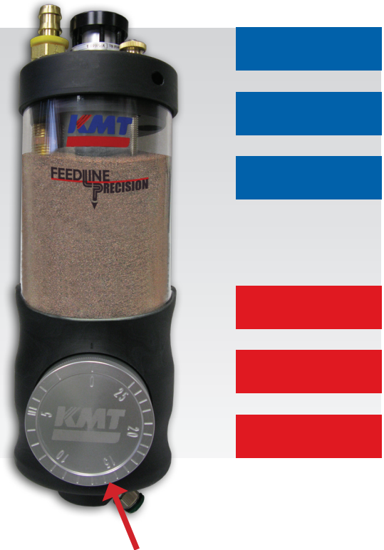
Dial-It-In Abrasive Control Knob---Adjusts While Cutting

An accurate and consistent abrasive feed-rate is critical to the waterjet abrasive cutting process. A well regulated feed-rate of abrasive cuts down on waste and results in a tighter cutting stream with a cleaner, smoother cutting edge.